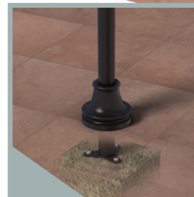
FOOT OPTION 2 - Decorative Foot