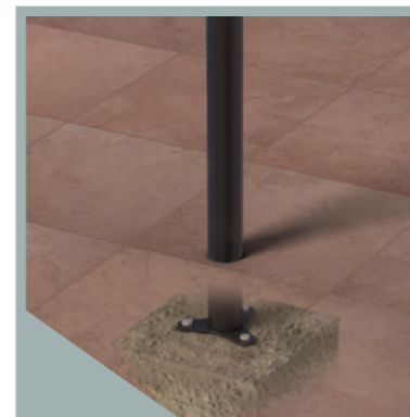
FOOT OPTION 1 - Post Only