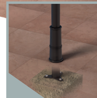
FOOT OPTION 3 - Decorative Tall Collar