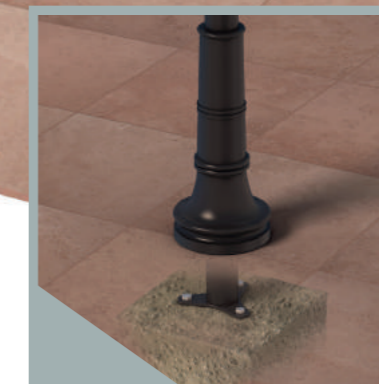
FOOT OPTION 4 - Decorative Foot and Tall Collar

Please note that Decorative Foot and Tall Collar options are optional extras. Contact Prefix Systems for further surveying and technical detail.