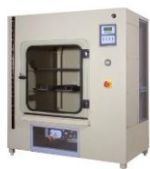
Vertical Salt spray chambers.