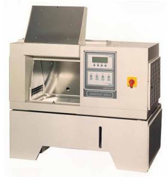
SOLARBOX 1500 E with FLOODING

PVC and corrosion-resistant materials ensure long life of this tank pump system: capacity up to 50 litres.