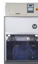
SOLARBOX R.H. with Humidity Control

We reserve the right to make changes to equipment and systems in response to advances in technology and modify parameter values accordingly.