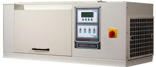
SOLARBOX 3000 E

Consequently, because the temperature produces an accelerated ageing, it is essential to be able to control of B.S.T. during exposure to filtered Xenon radiation.