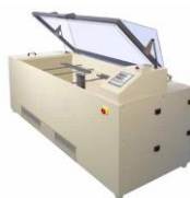
Horizontal Salt spray chambers.