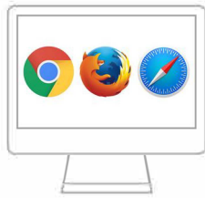
PC and Mac Chrome | Firefox | Safari