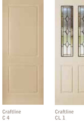
Craftline CL 1 B3GC