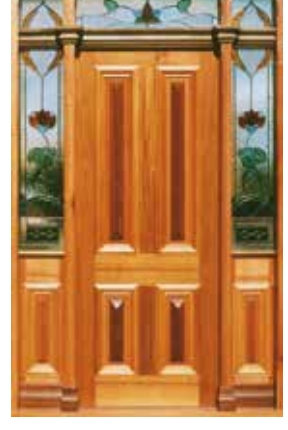
Victorian Entrance Frame Cherry Oak Frame with Side Panels and Overhead Transom featuring Gainic Lead Lite