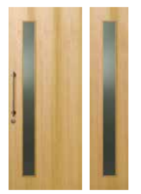
Tempus TEMA 101 & SLTEMA 101 Grey Tint