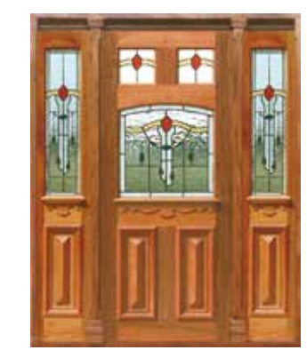
Victorian Entrance Frame Cherry Oak Frame with Side Lites featuring Edwardian Lead Lite