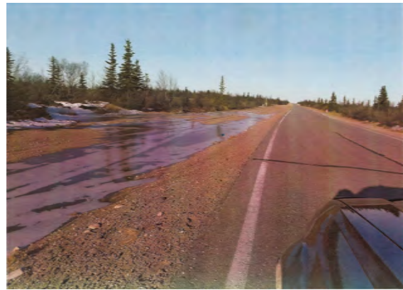
Sides of Iliamna community roadways become flooded with rain or snow melt