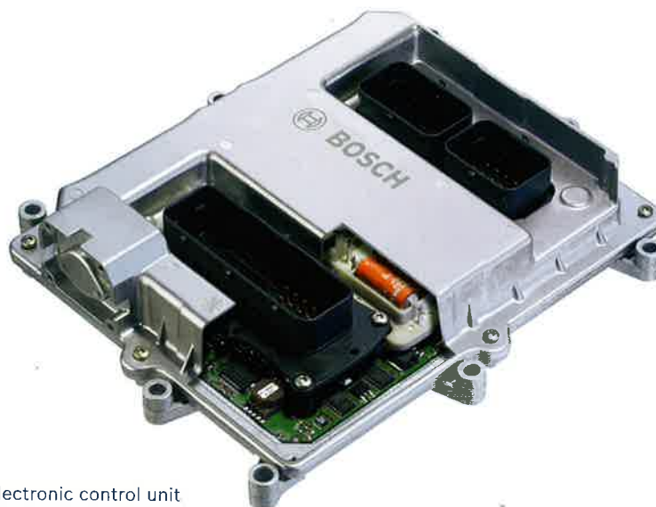
EDC 7 electronic control unit