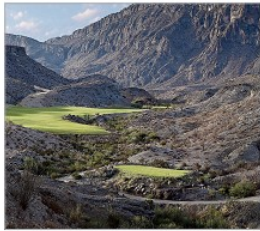
D Squared Productions

The par-4 No. 6 at Black Jack's Crossing Golf Course in Lajitas has the mountains of Big Bend National Park as a backdrop.