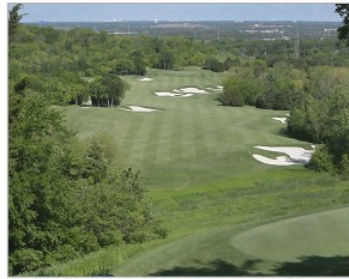
2015 File Photo/Staff

Bluejack National Golf Club, the course in Montgomery, which was designed by Tiger Woods and Beau Welling, dropped a spot to No. 4, and Escondido