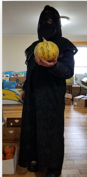
Halloween Volunteer Fun