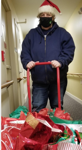
Christmas was made brighter for 203 children in the Cabot area!