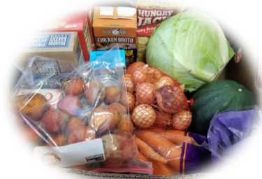
250 Thanksgiving Baskets were Distributed in Cabot & Lyndonville in November