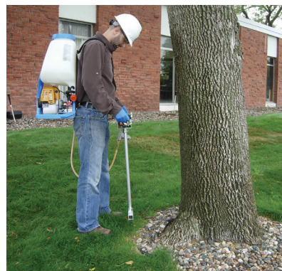
Treatment of trees with Lepitect is done via soil injection.