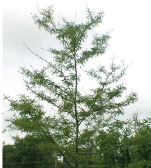
Honeylocust tree with heavy bagworm infestation.

The most common symptom of a bagworm infestation is defoliation of the canopy, coupled with seeing the actual silk bags, which are spun from the foliage of the host plant by the caterpillar, and used as a protective site when not out feeding on foliage.