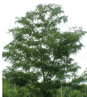
Honeylocust tree with uninfested canopy.

Bagworms construct their "bags" by spinning silk with the foliage of the tree they are feeding on. Bags are often confused with cones when they are on conifer trees