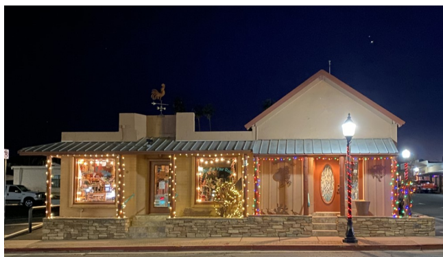
Business Winner: Rusty Rooster, 186 N. Tegner Street