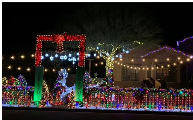
Residential Winner: Old Fashioned Christmas, 859 Poppy Street