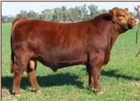
GOONOO RED KULCHER (GSJK28) Junior Champion Bull, National Show/Sale 2016 Maternal brother to N22