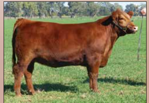
GOONOO RED KELLIE (GSJK18) Senior & Grand Champion Female National Show & Sale 2016