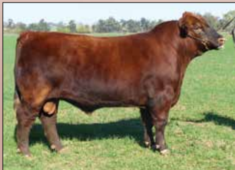
GOONOO RED KAIZER (GSJK35) Senior & Grand Champion Bull National Show & Sale 2016