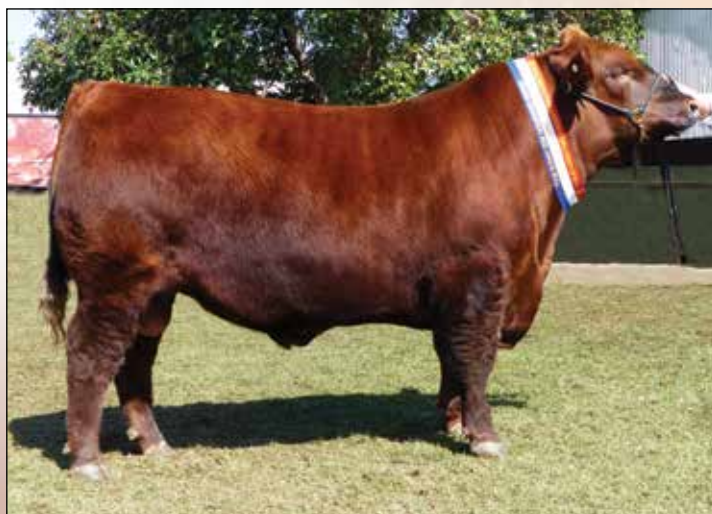
GOONOO CHUCK KENNY (GSJK14)

Sire: Pine Villa First Class, Brisbane Royal Grand Champion 2013 Dam: Waterfront Design, Brisbane Royal Grand Champion 2011 Senior & Grand Champion Red Angus Bull, Brisbane Royal 2015 Member Interbreed Champion Pair, Brisbane Royal 2015 Intebreid Champion Bull - Brisbane Royal Show 2015