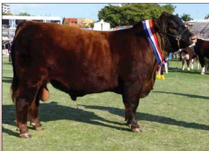
K5X Jackpot (GSJJ26)

Sire: Pine Villa First Class, Brisbane Royal Grand Champion 2013 Dam: Waterfront Design, Brisbane Royal Grand Champion 2011 Senior & Grand Champion Red Angus Bull, Brisbane Royal 2015 Member Interbreed Champion Pair, Brisbane Royal 2015 Intebreid Champion Bull - Brisbane Royal Show 2015