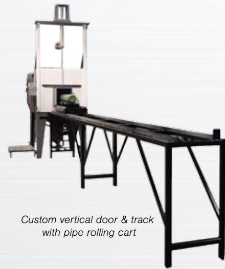
Custom vertical door & track with pipe rolling cart