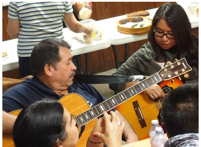
Photos courtesy of Larry Woodworth. See more photos on the church website.