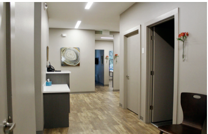
Cooper Dental building