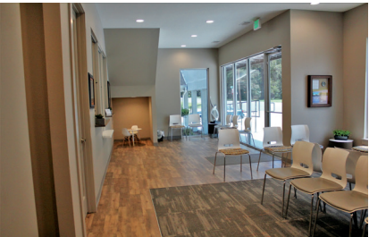
Cooper Dental building