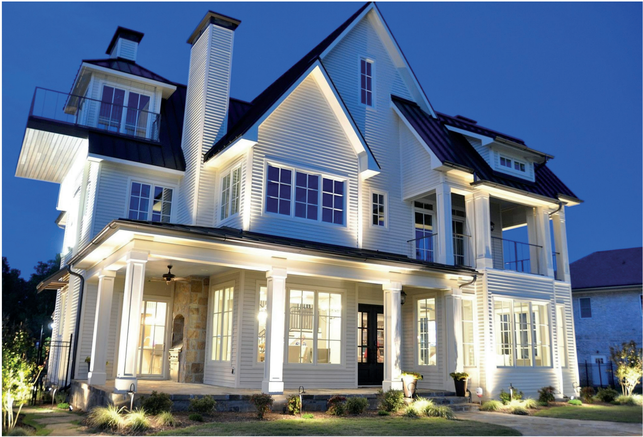
Rockwater house at night