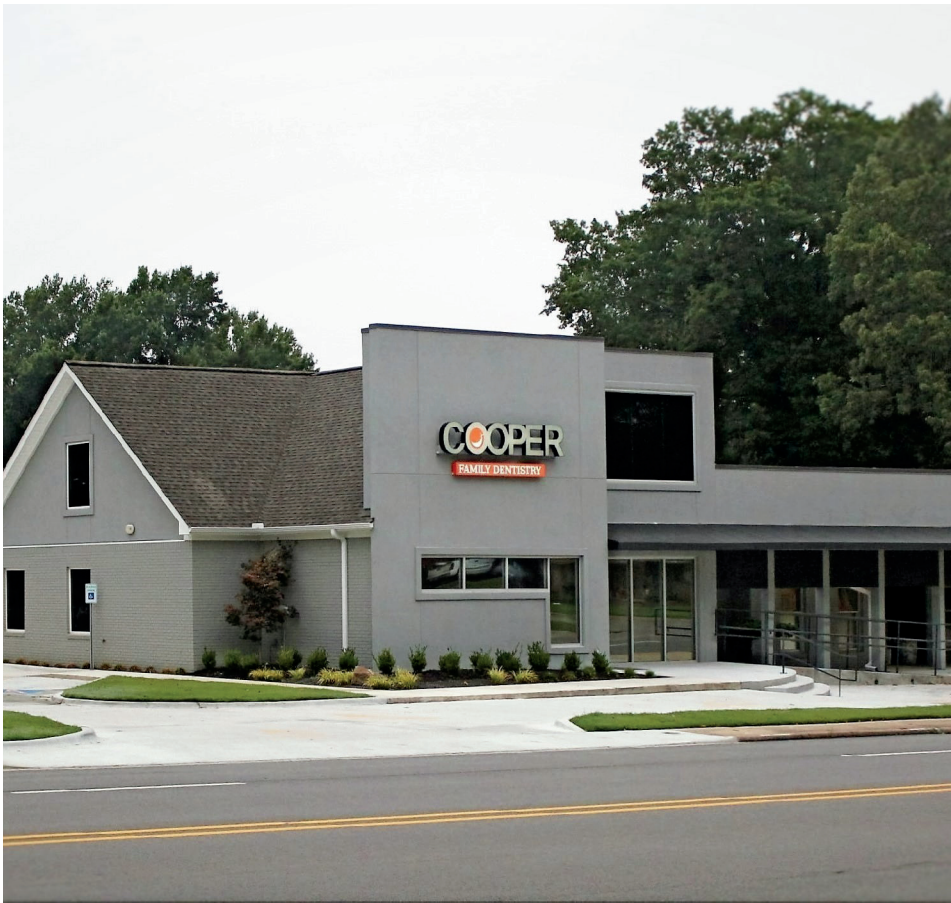
Cooper Dental building