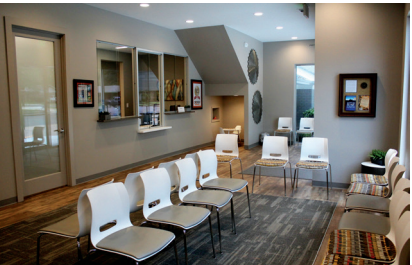
Cooper Dental building