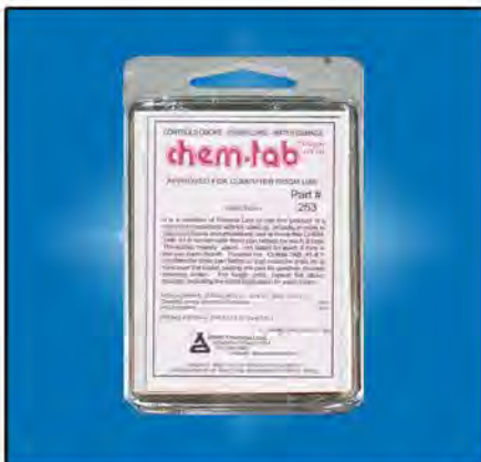
Part # 253 - 6 Tablet Pack

Chem-Tab condensate drain pan tablets is a safe pre-measured tablet that keeps the drain pan clean of slime, scum and other accumulations.