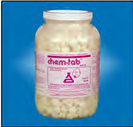
Part # 251-B 1500 Tablet Jar