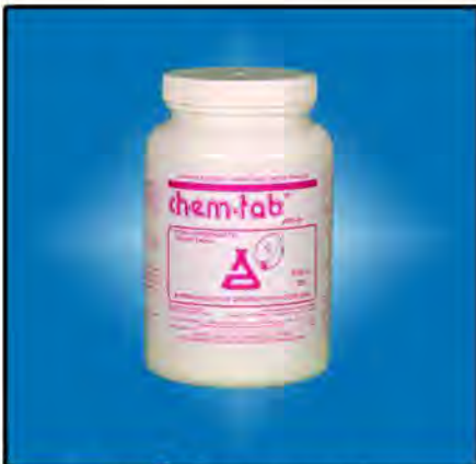
Part # 251 - 100 Tablet Jar