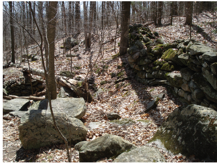
foundation of cheese box mill

Ascend B to cheese box mill 0.8 > Memorial 0.9 > Cliff viewpoint 1.1 > class 2 ledge > right turn onto road 1.7 > return to car 2.0