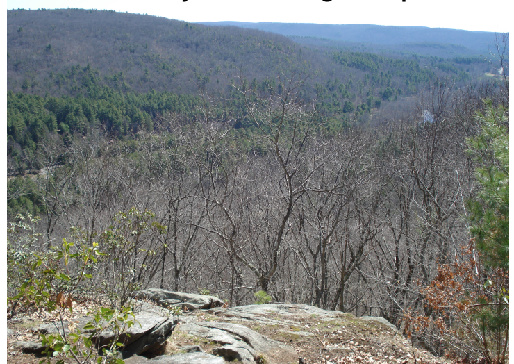
Turkey Vulture Ledge viewpoint