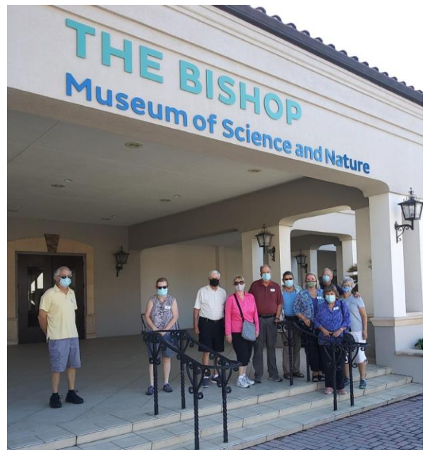
Our Merry Little Group