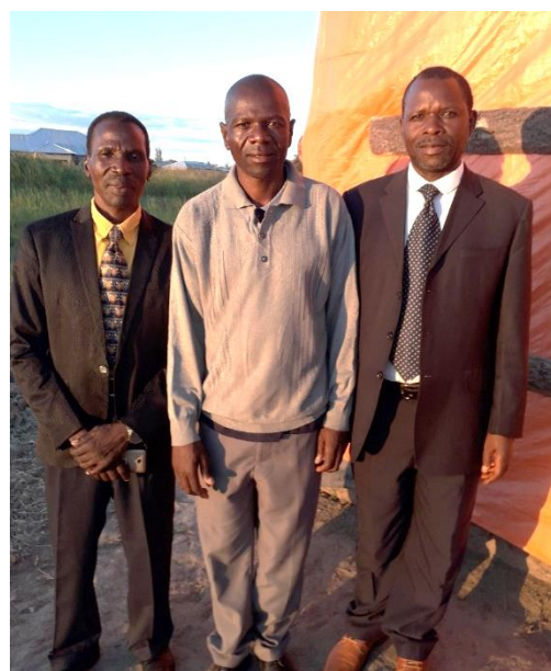
Chichewa and Bemba Bible translators