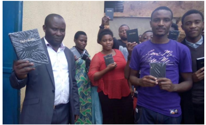
KJV Bible distribution in Kigali, Rwanda.

E-mail: fgea@hotmail.co.uk Website: www.freegrace-ea.org