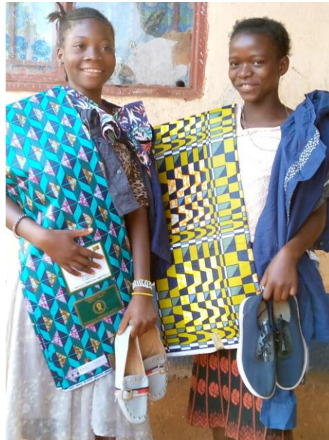
Orphans at Fizi (Dem Rep Congo) receiving new clothes, shoes, and material for making dresses.

E-mail: fgea@hotmail.co.uk Website: www.freegrace-ea.org