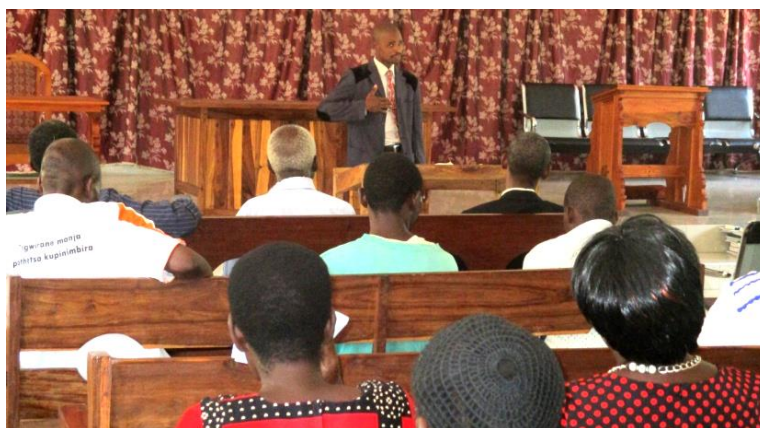
Teaching on the Bible in Malawi at an FGEA meeting

E-mail: fgea@hotmail.co.uk Website: www.freegrace-ea.org