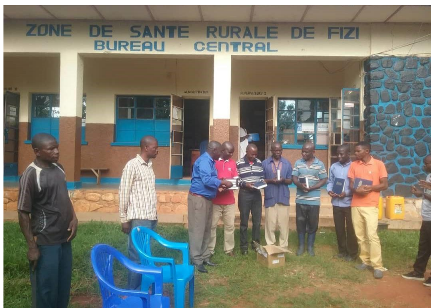
Bible distribution to staff at the Central Office for Rural Health in Fizi, Dem Rep Congo