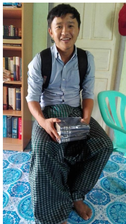
Burmese Bibles received in Myanmar