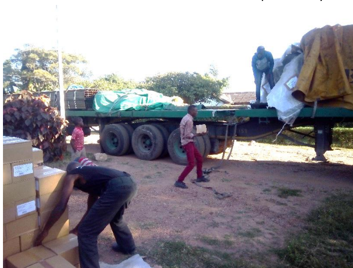
Arrival of the lorry in Kabwe of the TBS grant for FGEA Zambia. 356 Boxes of Scriptures and Booklets were off-loaded by hand.

E-mail: fgea@hotmail.co.uk Website: www.freegrace-ea.org