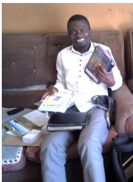
Scripture distribution in Zimbabwe and Zambia