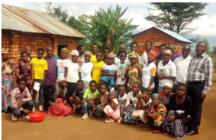
Recent photo from Fizi Orphan Centre, Eastern Congo.

E-mail: fgea@hotmail.co.uk Website: www.freegrace-ea.org