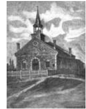
St Gabriel Street Church

particularly on the protestant population. Many of the British soldiers were from Scotland serving in the famous Black Watch and Fraser Highland regiments and were happy to remain, marry and settle in Montreal or the surrounding countryside, having received generous grants of land from the Crown. Following both conflicts there was a surge of immigrants to Montreal, mainly from Scotland and Ireland but there were also many American families, known as United Empire Loyalists, who were still loyal to the British Crown or who saw business opportunities in Montreal and came to start a new life here.