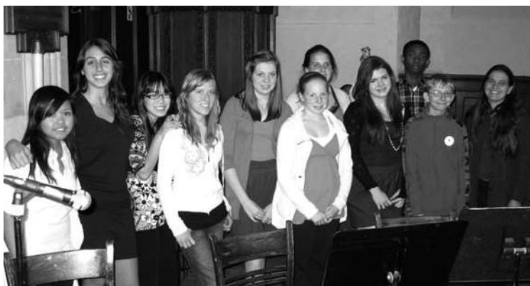
Mountainside United TM2 group joined by City View United.