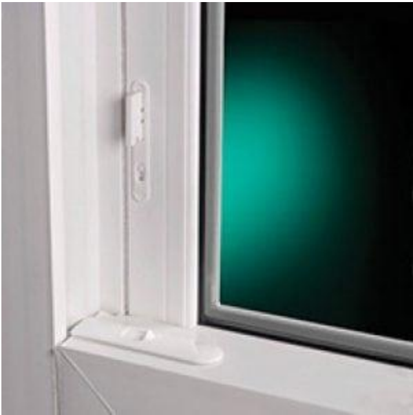
Low-profile cam-action lock.