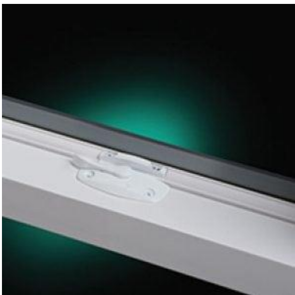
Contoured tilt latches and sash vent stops.