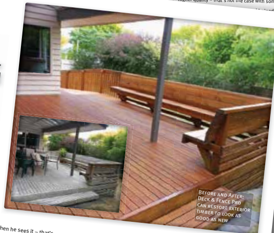
BEFORE AND AFTER: DECK & FENCE PRO CAN RESTORE EXTERIOR TIMBER TO LOOK AS GOOD AS NEW

Daryl confirms that's true. 'I've got everything I need and furthermore the products I use cost less than most DIY products while being of much higher quality - that's not the case with some businesses I looked at