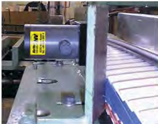
aligning of layers