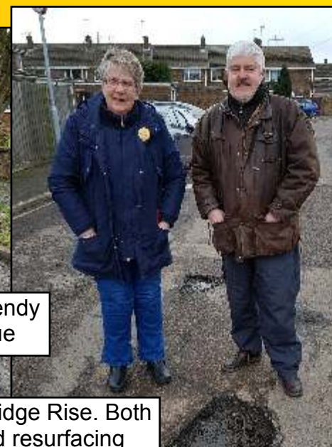
...and in Torridge Rise. Both roads need resurfacing