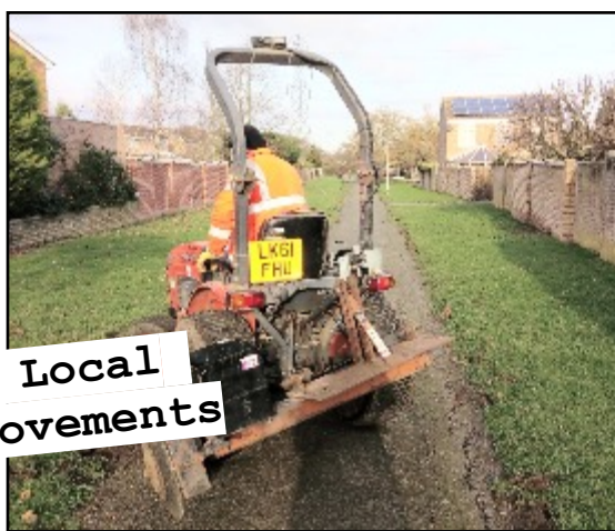
Street Scene and Local Environment Improvements