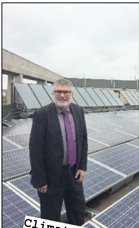
Climate Change Fund