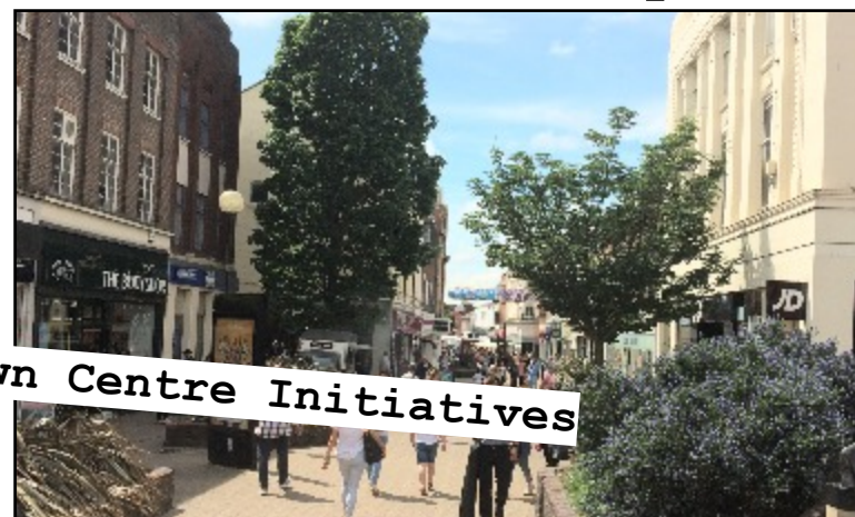
Town Centre Initiatives