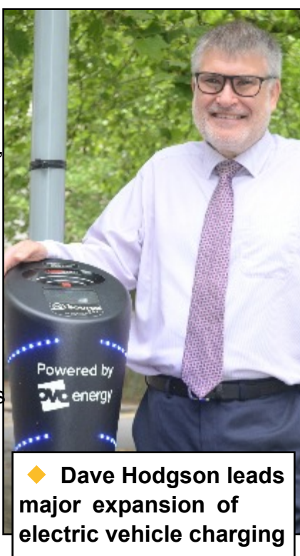
◆ Dave Hodgson leads major expansion of electric vehicle charging

Mayor Dave Hodgson said "Bedford Borough Council has always been ahead of the curve when it comes to protecting our environment. In 2018/19, the Council achieved a 50% reduction in carbon emissions in its own Council operated buildings, and is now looking to extend this and reach carbon neutrality by 2030. Electric vehicles are set to become an increasingly common sight in our towns and we are getting the infrastructure in place to help residents embrace this change."