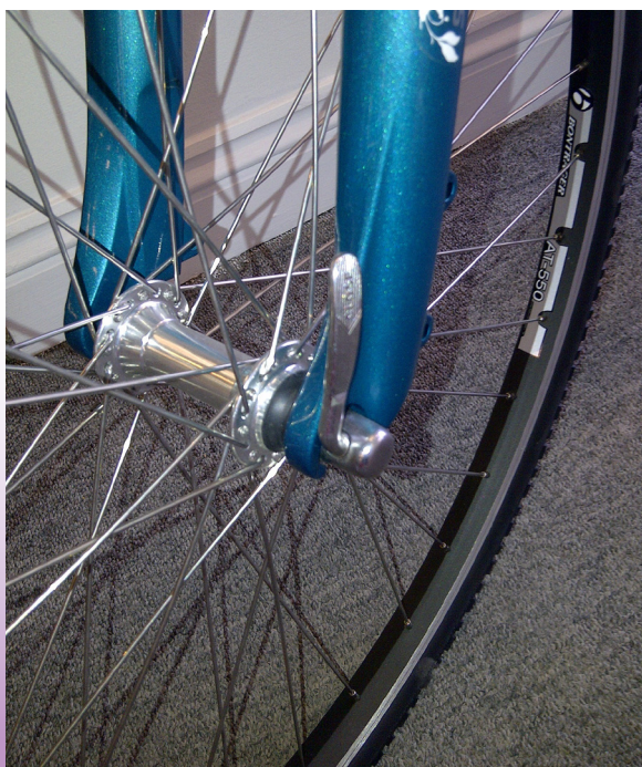
The price fixing allegation in Apple is a basic 'hub and spoke', but it has several interesting twists

quickly acted to complete the [conspiracy] by imposing agency agreements on all their other retailers. As a direct result, those retailers lost their ability to compete on price, including their ability to sell the most popular e-books for $9.99 or for other low prices. Once in control of retail prices, the Publisher Defendants limited retail price competition among themselves.