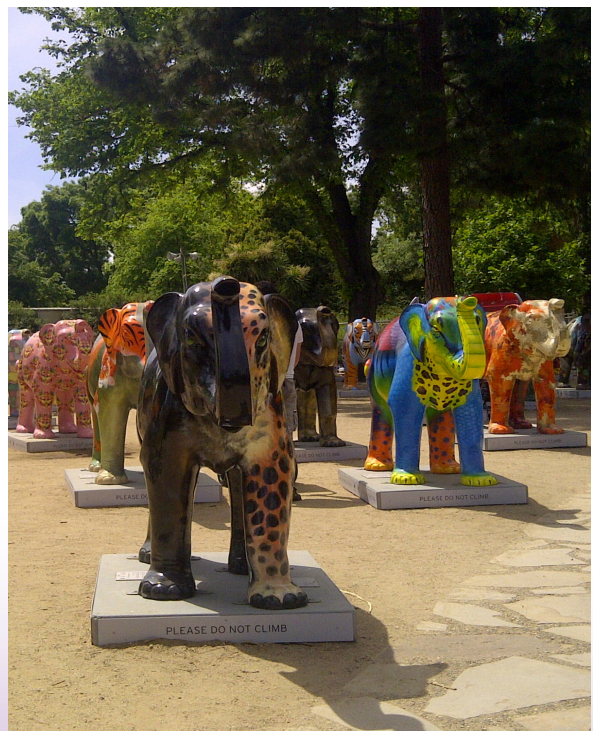
The idea that agents are simply avatars of their respective principals is turned on its head in ACCC v Flight Centre

As a general rule, brokers sign up customers for, say, a home loan, and then receive a commission from the relevant bank. Mortgage Refunds tended to pass onto its customers part of that commission. The ACCC alleges that ANZ sought to reach an agreement with Mortgage Refunds to limit such payments to customers as a condition of ongoing relations with the bank.