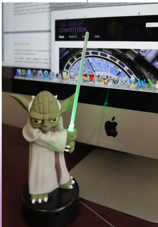
Can Apple defend itself against price fixing claims?

Price fixing is perhaps the best known of Australia's per se prohibitions: regardless of any impact on competition or the prices ultimately paid by consumers, competitors can't agree on prices. 'Competitors' is generally thought to be a straightforward term which does not encompass agents. But some recent cases highlight how agents and other commercial partners can find themselves in price fixing trouble. One of those cases, USA v Apple, also raises interesting issues regarding market power, market share and most favoured nation clauses.