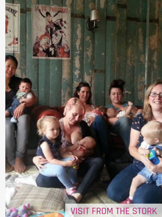
VISIT FROM THE STORK

Throughout this document we highlight a handful of 'Pandemic Pioneers' who are demonstrating resilience during the Lockdown and have adapted their business and services to scale and grow to meet new needs and support vulnerable communities.