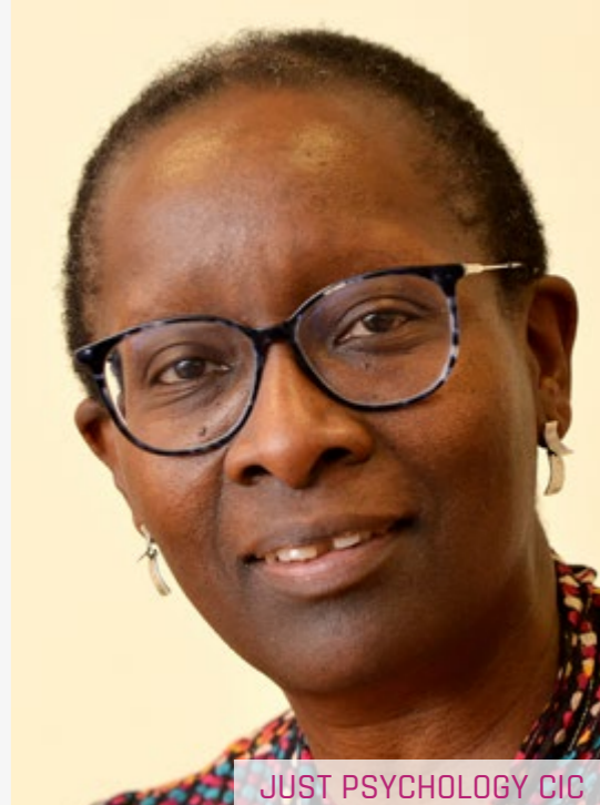
JUST PSYCHOLOGY CIC

CLES - Community Wealth Builder's Toolkit