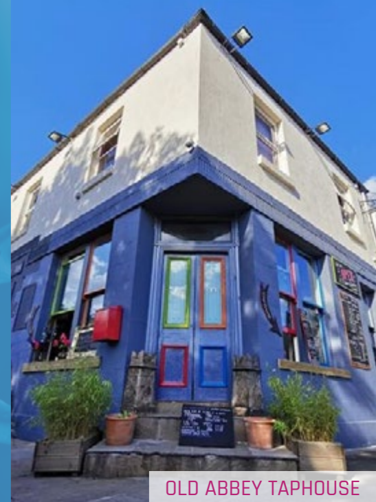
OLD ABBEY TAPHOUSE

Institute of Directors NW and Isle of Man Awards