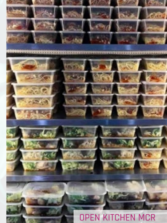
OPEN KITCHEN MCR