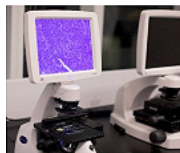
EVOS microscopy system

With parental consent, a sample of every tumour that is surgically removed is stored in liquid nitrogen in the tumour bank, allowing the accumulation of clinical data for neuro-oncology research.