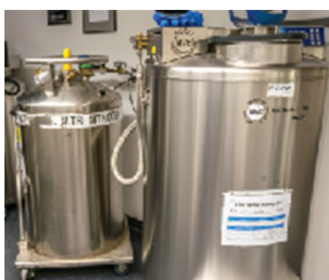
Brain tumour bank

Allows detection of rare mutations within genes that are linked to causing brain tumours. Essentially allows researchers to find the "needle in the haystack".