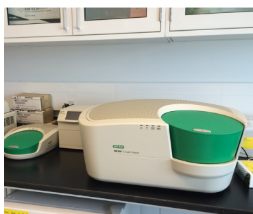
Digital droplet PCR