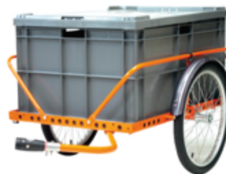
Loadstar and Euroload Trailer both by Pashley www.pashley.co.uk

Sleep under the stars and cycle everywhere – updated trailers, carriers and camping gear make the outdoors available to everyone. Think camping as the new picnic.