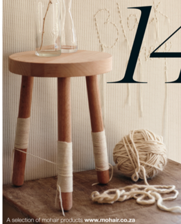
A selection of mohair products www.mohair.co.za