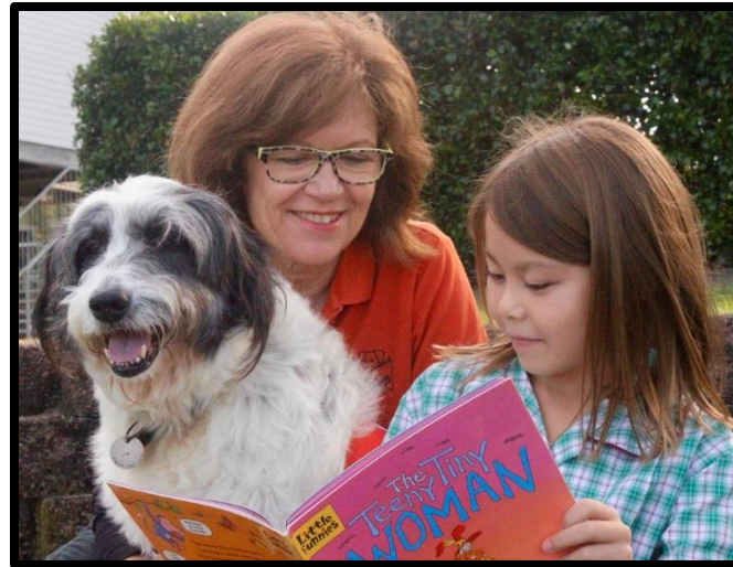
‘Charli’ the beared Collie makes a perfect reading partner

Story Dogs is the spark to light the fire!