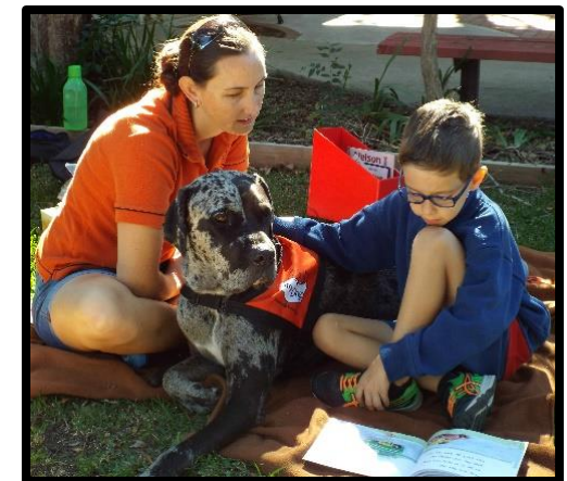
'Clyde' the Great Dane listening patiently

Dog Teams must pass an accreditation by a certified dog trainer as well as being immaculately groomed, vaccinated and vet checked.