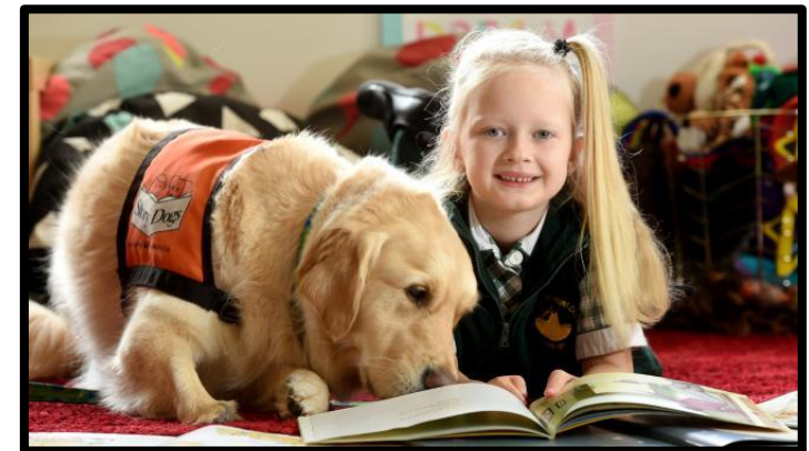
‘Stumpy’ the Story Dog enjoying another good story.

Our mission is to make reading fun for children, so they become confident, lifelong readers.