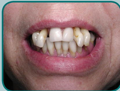
8.30 am: Multiple extremely mobile teeth and a completely unsatisfactory partial denture.