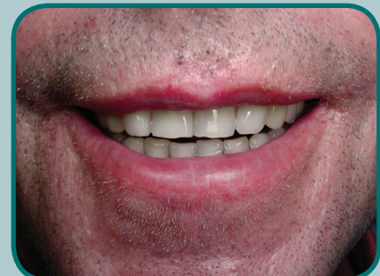
4.00 PM: Full upper and lower immediate dentures.