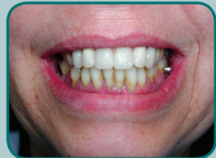
4.30 PM: Full upper immediate denture; Significant alteration to the natural lower teeth was also required to create an acceptable occlusal plane.