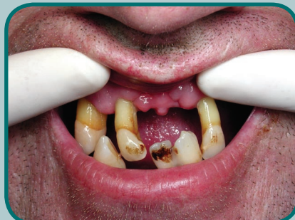
8.00 am: Multiple mobile upper and lower teeth: collapsed dentition: Patient had never worn a denture.