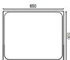
Mod. 2/1 Esterno 650x530mm