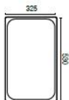
Mod. 1/1 Esterno 530x325mm