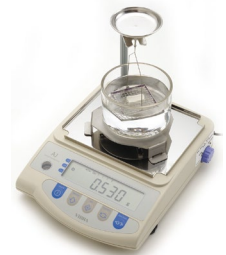
AJH: KIT SPECIFIC WEIGHT MANUAL