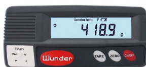
NHB: REMOTE INDICATOR