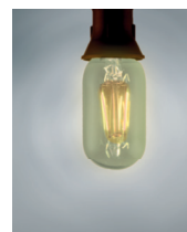
T45 - Tube