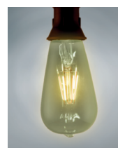
ST64 - Pear