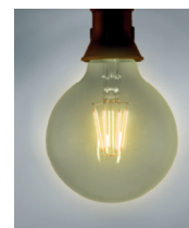
G95 - Globe