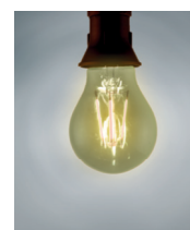
A60 - Classic