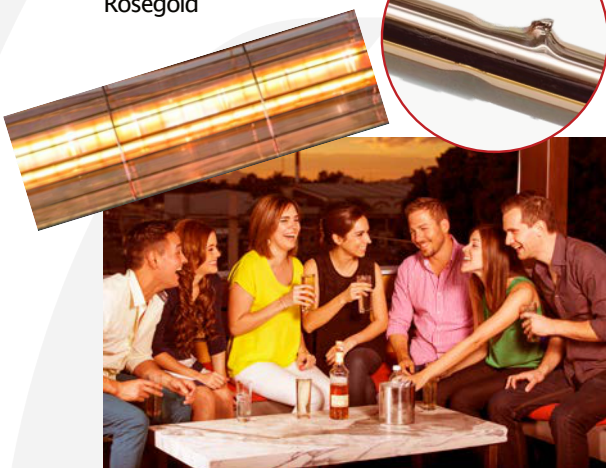
Standard low glare