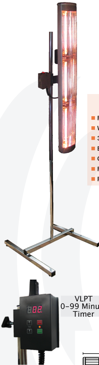
VLPT 0-99 Minute Timer

Area coverage @ minimum operating distance of 500mm = 1500 x 500mm