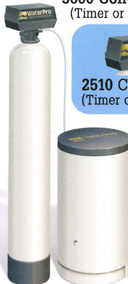
2510 Control (Timer or Metered)