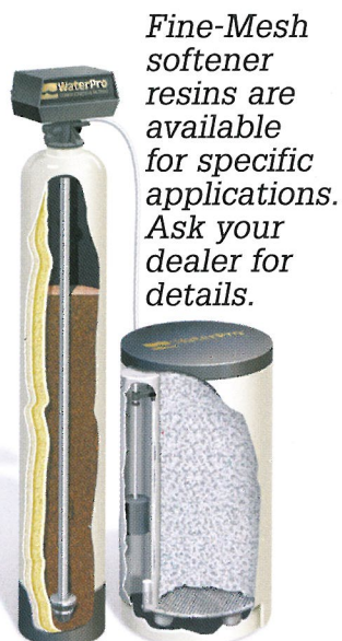
Cutaway of a typical WaterPro Conditioner.

and the products to make your life better with all the advantages and cost savings you get with conditioned and filtered water. Every application is unique. Rely on your WaterPro dealer to test your water and specify equipment you need.