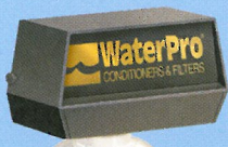
2510 Timer or Metered