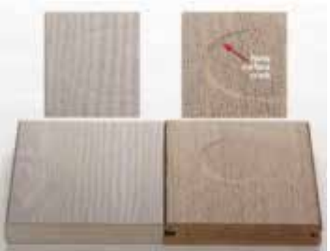
Clubhouse Competitive Cellular PVC Decking

Laboratory impact tests* prove that Clubhouse Decking with Korelite technology has better impact resistance.