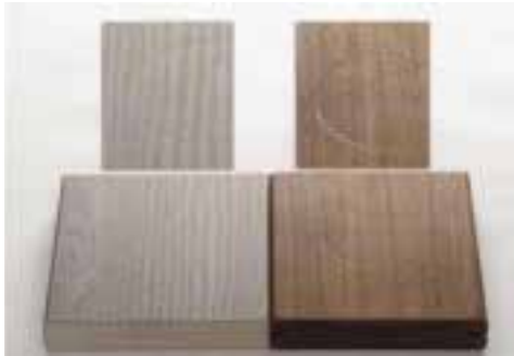
Clubhouse Brazilian Hardwood