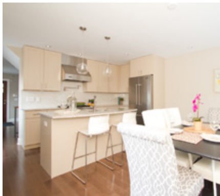
612 Clymer St | $795,000