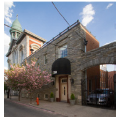
730 Montrose St D | $450,000

Visit our website to learn more about these properties and more!