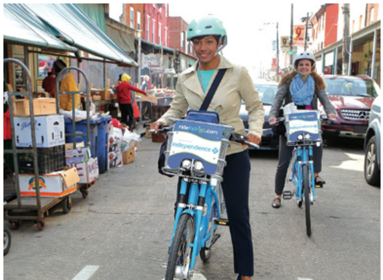
Indego Bike Share has proven to be a popular new addition to Bella Vista.