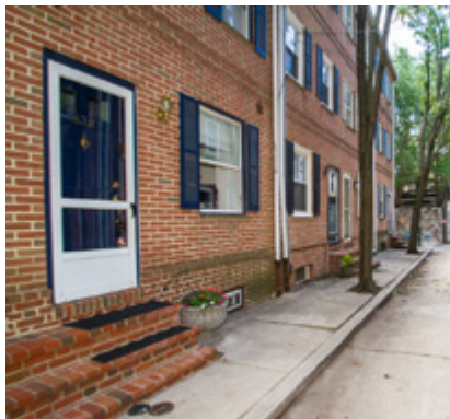
832 Kater St | $375,000