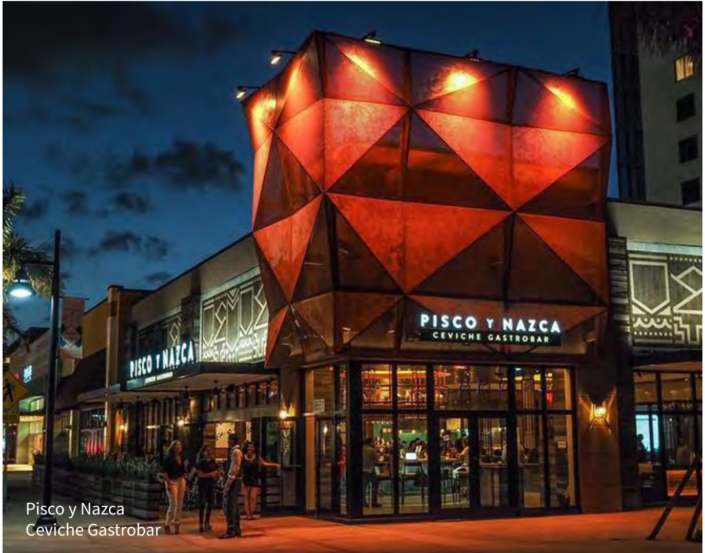
Pisco y Nazca Ceviche Gastrobar