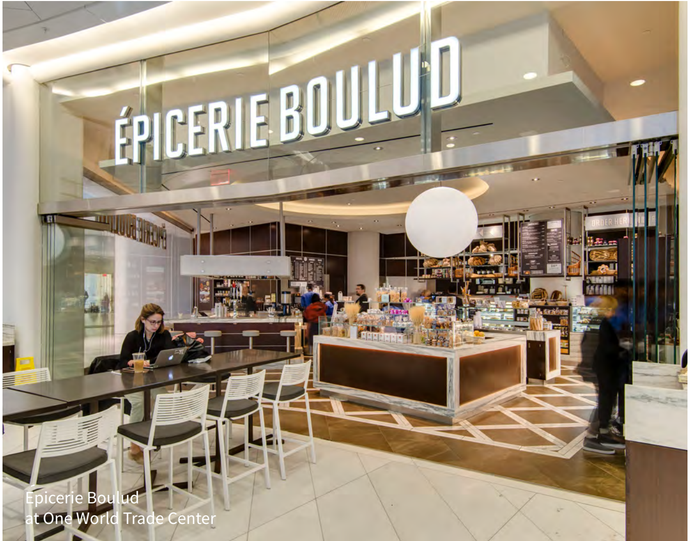
Épicerie Boulud at One World Trade Center