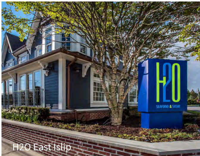
H2O East Islip