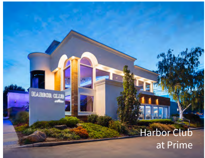
Harbor Club at Prime