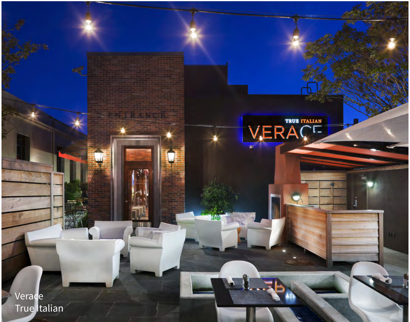
Verace True Italian