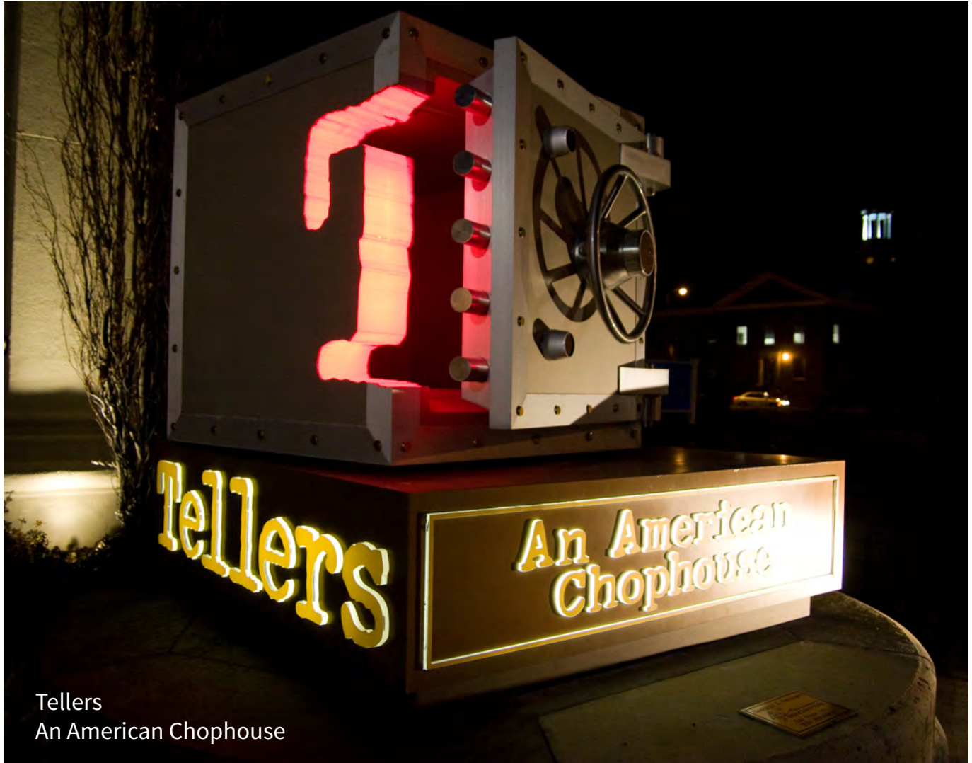
Tellers An American Chophouse