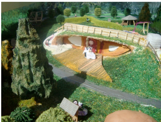
The How Where Waterhouse © Elbert Slikkerveer.