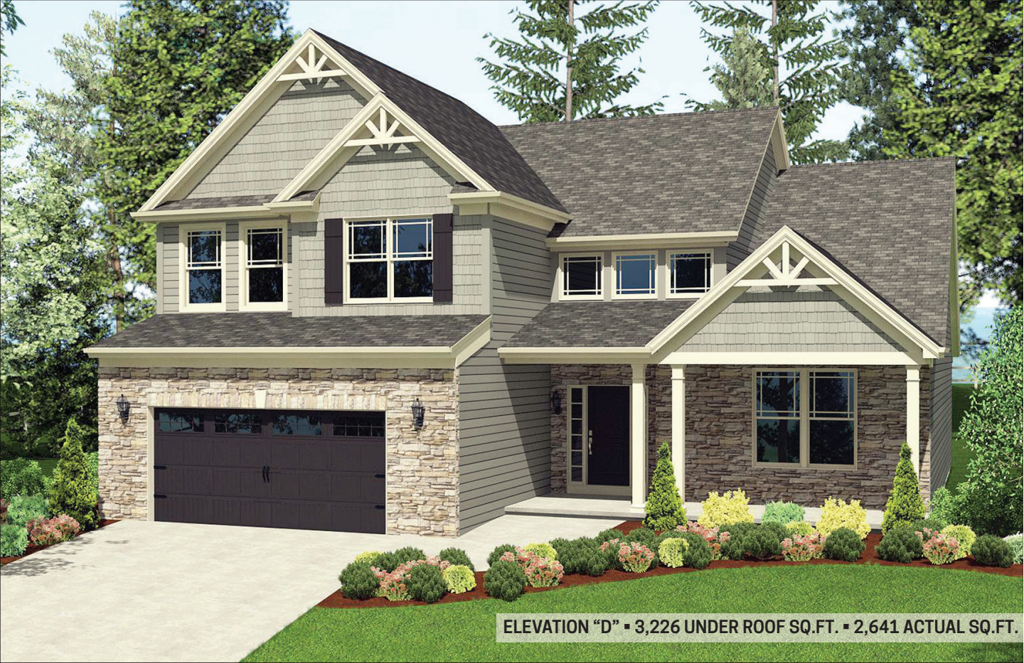
ELEVATION “D” • 3,226 UNDER ROOF SQ.FT. • 2,641 ACTUAL SQ.FT.