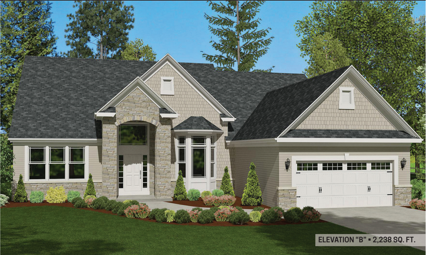
ELEVATION "B" = 2,238 SQ. FT.