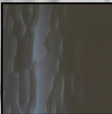
GREY WATER REFLECTIVE