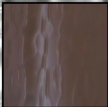
BRONZE WATER REFLECTIVE