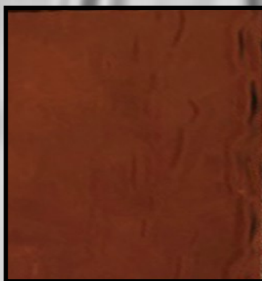
COPPER RED WATER REFLECTIVE