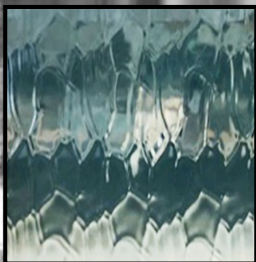
CLEAR WATER REFLECTIVE