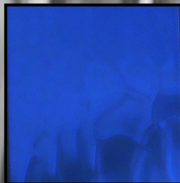
ROYAL BLUE WATER REFLECTIVE