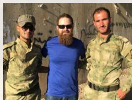
What of the souls of Kurdish soldiers? These men are Yezidi Kurds fighting against ISIS. Who will go to them?

This is the heart of every Kurdish man, woman and child. No matter the differences in politics, religion, tribe or language this is the one desire all are agreed on. They love their flag, their soldiers, and their cultural heritage. Although they were promised a country of their own after the break-up of the Ottoman Empire in 1916, they were denied a nation and spread out among others who hated them. There are an estimated 30 million Kurds worldwide without an internationally recognized piece of land that belongs to them and them alone. Much like the Native American Indian of North America, they are an ‘issue’ for their host governments to ‘deal with.’ The Kurdish Question has ever been answered with genocide and war.